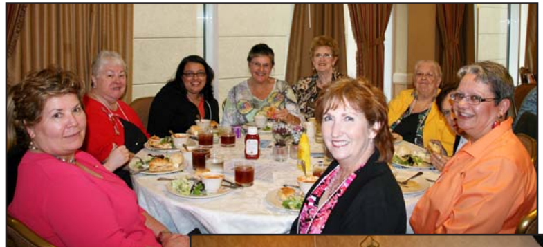
^ Members enjoying a meal.