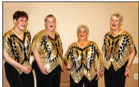
"Hearts Content," a Sweet Adelines quartet, entertained after the Installation Ceremony.