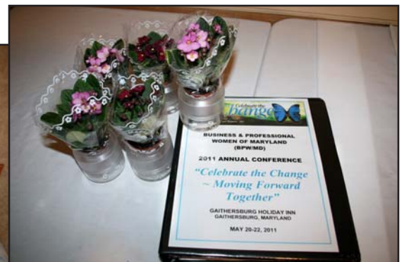
^ Flowers and Celebrate Change Board book.